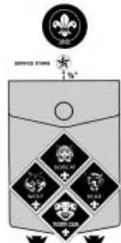
WEBELOS SCOUT LEFT POCKET (OPTIONAL)

Conduct uniform inspections with common sense; the basic rule is neatness.