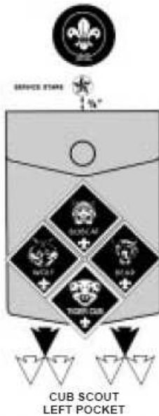
CUB SCOUT LEFT POCKET