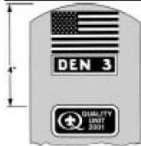
CUB SCOUT OR WEBELOS SCOUT RIGHT SLEEVE