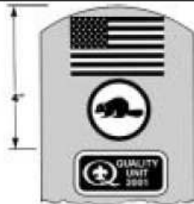
WEBELOS SCOUT RIGHT SLEEVE